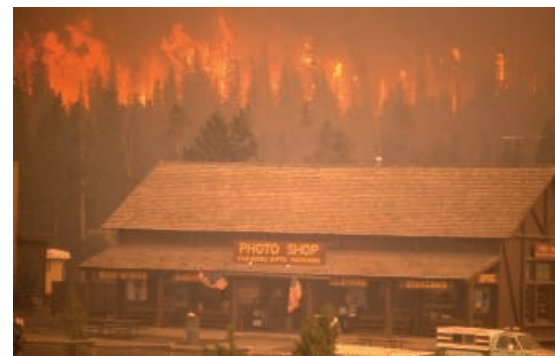
Too close for comfort. Wildfire is seen approaching Old Faithful Village, Yellowstone National Park, in 1988.

Higher spring and summer temperatures and earlier snowmelt are extending the wildfire season and increasing the intensity of wildfires in the western United States.