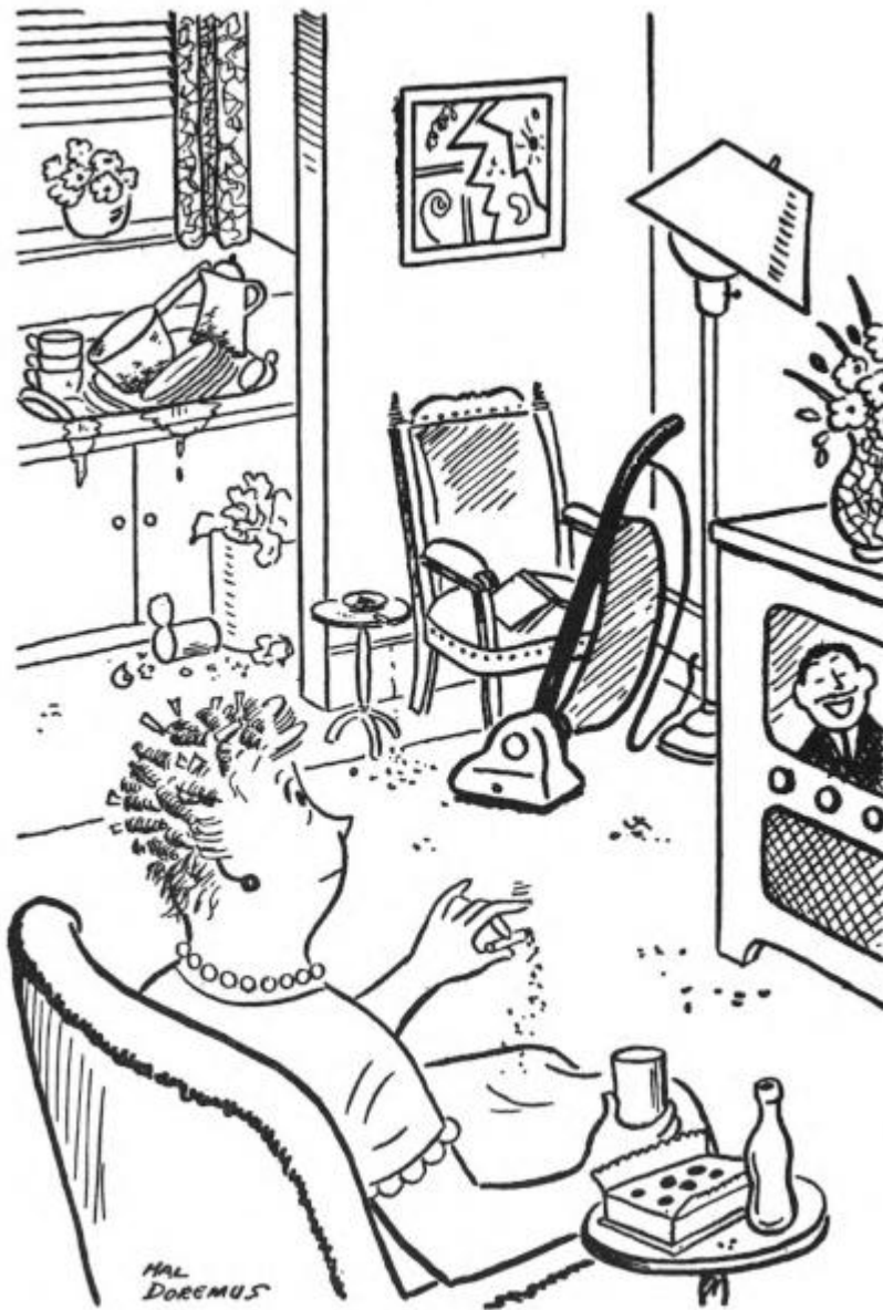
Horse waif enjoin toil-evasion.