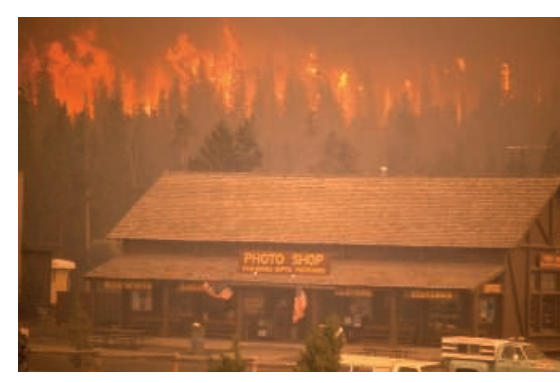
Too close for comfort. Wildfire is seen approaching Old Faithful Village, Yellowstone National Park, in 1988.

The fires in Yellowstone Park in 1988 (see the first figure) seemed to inaugurate this new era of major wildfires in the western United States. The fires lasted more than 3 months, burning 600,000 ha of forest, and—despite